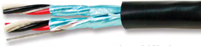
Series E1BED - Pairs