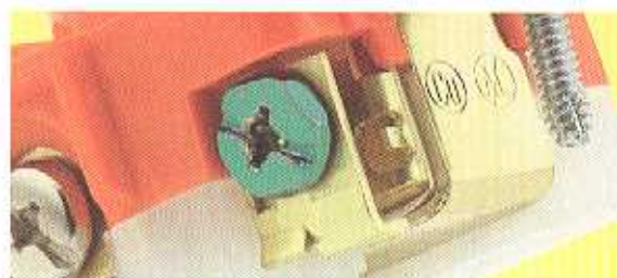
Backwire Bundling Clamp